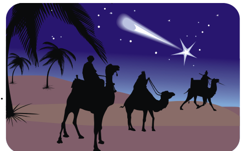
Wise men and women heading for Melbourne April 2015