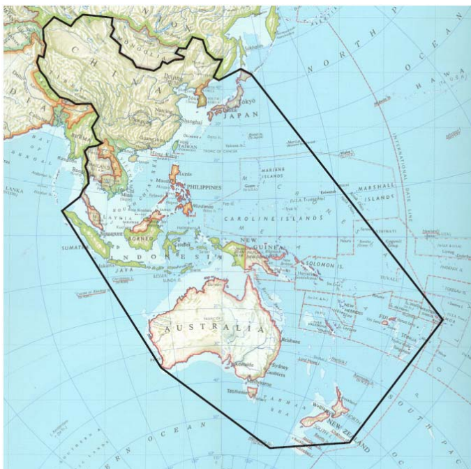
IGA Western Pacific Regional Branch Map

boundaries. The inaugural AGM will be held during the Workshop/Seminar with membership being voluntary.